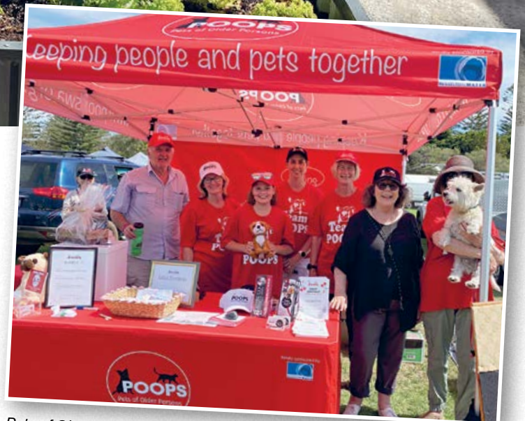
Pets of Older Persons (POOPs) showcased its striking new gazebo, purchased with funds from the Busselton Water Community Partnership Program.