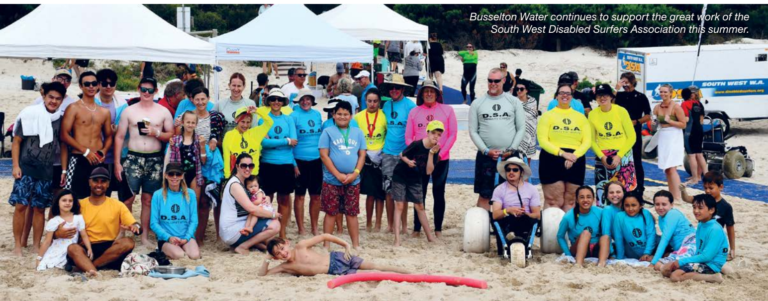
Busselton Water continues to support the great work of the South West Disabled Surfers Association this summer.

Busselton Water is also supplying rainwater tanks to Vasse Primary School to help upgrade its playground and nature scape area.