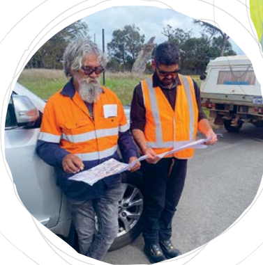
(Clockwise from top) Traditional owners meet with Busselton Water personnel and surveyors to discuss plans to expand the local water network.

In the meantime, Busselton Water's Reconciliation Action Plan has reached a major milestone. Our inaugural Reflect RAP has been conditionally endorsed by Reconciliation Australia. The RAP sets out reconciliation commitments in line with our business objectives.