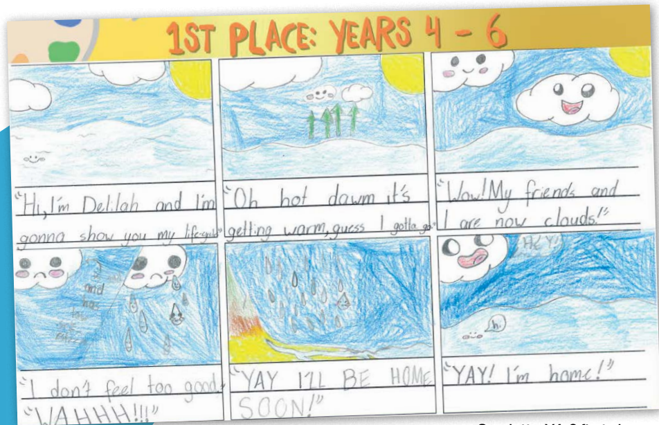
Scarlette, Y4-6 first place