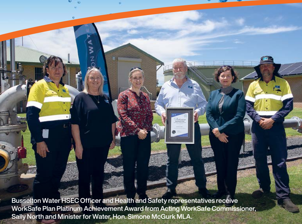
Busselton Water HSEC Officer and Health and Safety representatives receive WorkSafe Plan Platinum Achievement Award from Acting WorkSafe Commissioner, Sally North and Minister for Water, Hon. Simone McGurk MLA.