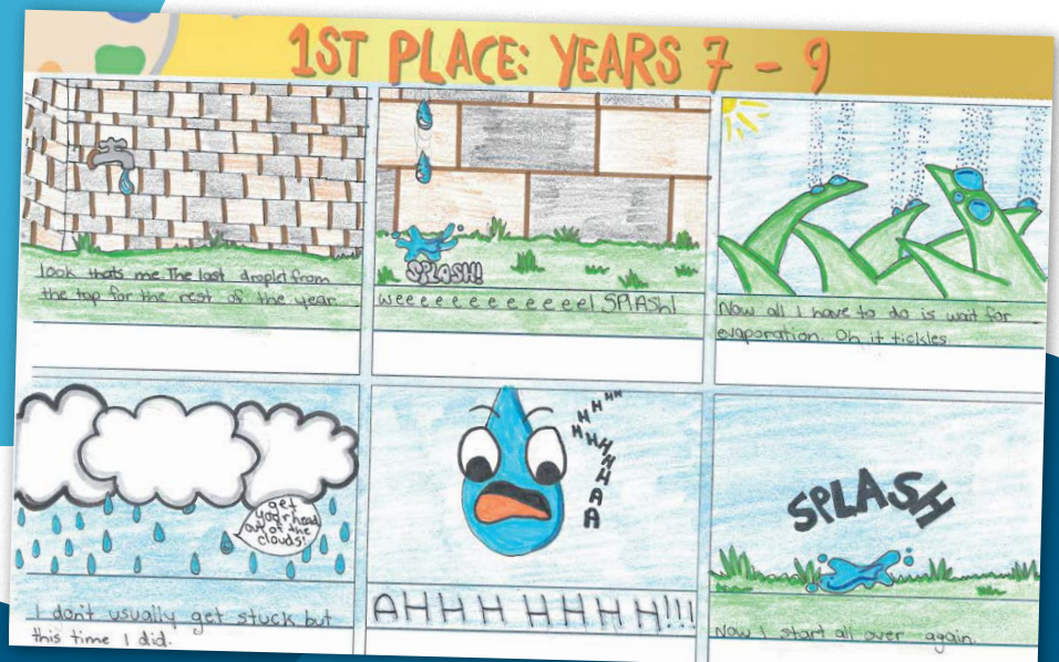
Abbey, Y7-9 first place